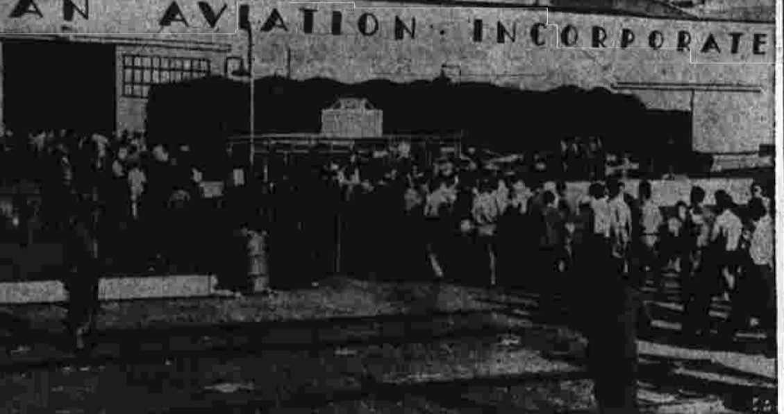
With the North American Aviation plant at Los Angeles under control of the United States Army, a steady stream of workers (above) returned to their jobs producing planes for the United States Army.

Los Angeles, June 11.—(AP)—The North American Aviation plant at Los Angeles under control of the United States Army, a steady stream of workers returned to their jobs producing planes for the United States Army today.